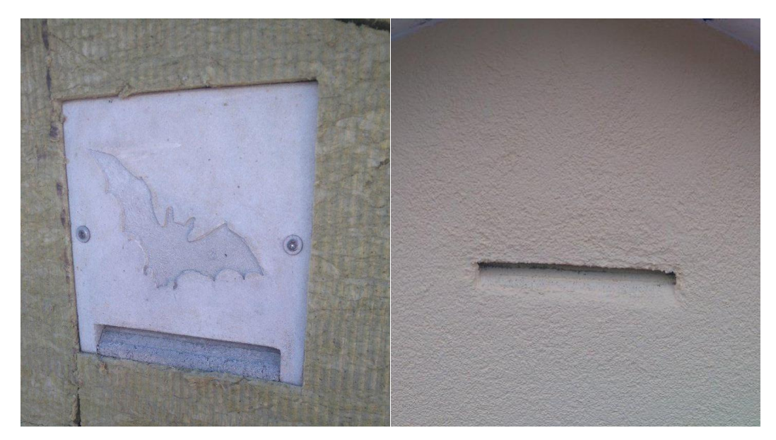
Figure C2- 1: Bat box mitigation/enhancement example