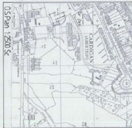
OS Plan 1:2500 Sc