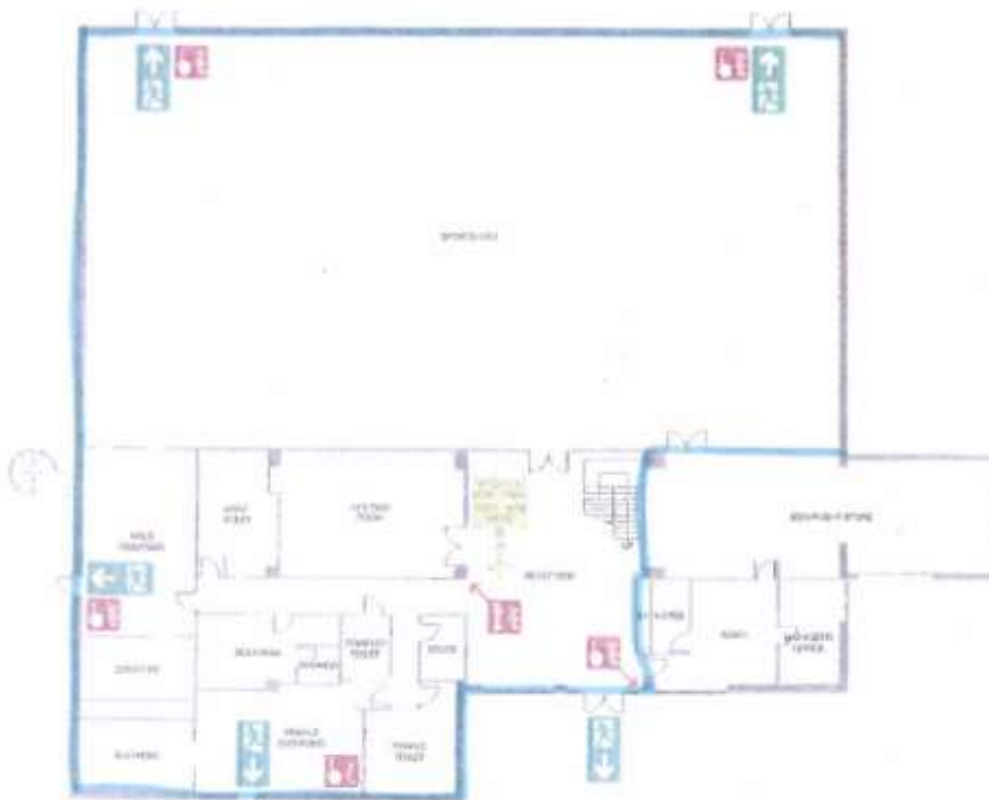
LLAWR GWAELOD - GROUND FLOOR