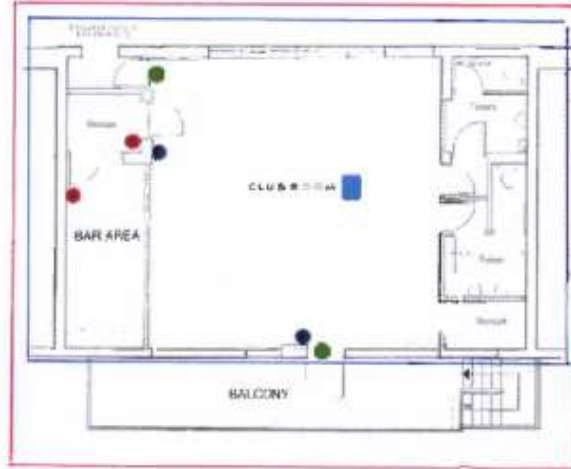
ABERYSTWYTH BOAT CLUB - Promenade Level