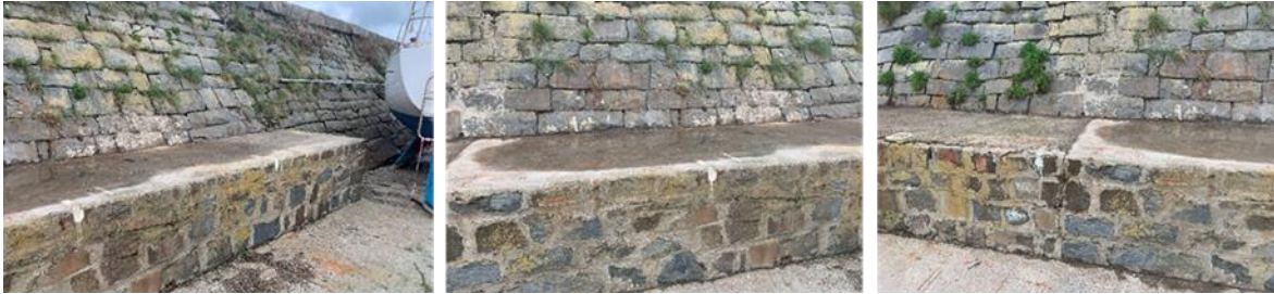
Raised are of the pier at New Quay Harbour.

The Harbours Team will liaise with CADW and other Council Officers with a view to installing signage to reflect the above.